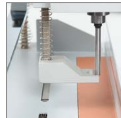
J a b'bf'j'flz'_m